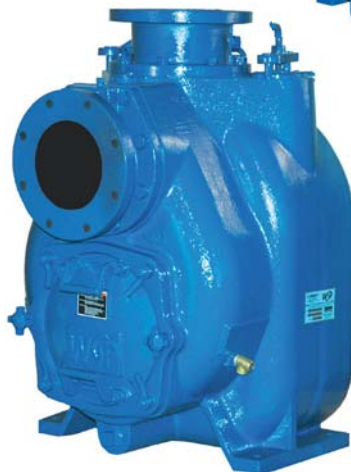
8" / 200 mm Head to: 109' • 33 M Flow to: 2,600 GPM • 600 M 3 /hr Solids size: 3 inch • 75 mm