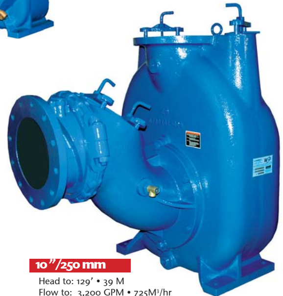
10" / 250 mm Head to: 129' • 39 M Flow to: 3,200 GPM • 725 M 3 /hr Solids size: 3 inch • 75 mm

Pump & Parts directly interchangeable with many GRESKO®, Pioneer® and Gorman-Rupp® pumps.