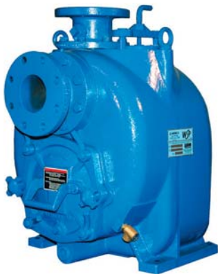
6" / 150 mm Head to: 109' • 33 M Flow to: 1,480 GPM • 335 M 3 /hr Solids size: 3 inch • 75 mm