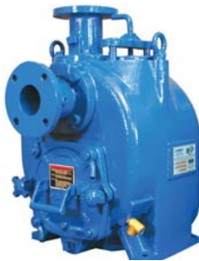
3" / 75 mm Head to: 112' • 34 M Flow to: 450 GPM • 102 M 3 /hr Solids size: 2.5 inch • 63.5 mm

Add it up... You'll see why the WEMCO Self-Primer offers more value... ✓ Materials/Design ✓ Ease of Maintenance ✓ Pump Features ✓ Safety Features ✓ More Dependable ✓ Lower Operating Cost